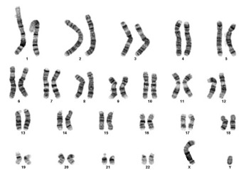
Chromosomes pairs 1-22, X and Y (male)

Most of our cells normally contain 46 chromosomes, organised as 23 pairs. We usually inherit one chromosome of each pair from our mother and the other from our father. Chromosome pairs are numbered 1 to 22 and the 23 rd pair comprises the sex chromosomes, which determine biological sex (whether we are male or female). Females usually have two X chromosomes (XX) and males usually have an X and a Y chromosome (XY).