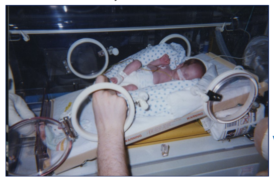
A 49,XXXXY baby born early at 34 weeks (4 weeks old in this photo)

Apgar scores, which give a general indication of the baby's condition at birth, ranged from 3 to 9 at one minute and from 8 to 10 at five minutes. Around one boy in three described to Unique needed resuscitation after birth and spent some days or weeks in special care. Most boys had difficulty latching on and sucked weakly or hardly at all in the early days. Almost all were unusually quiet for a new baby, scarcely cried or just made a soft, cat-like mewing sound or low grunting noise (Linden 1995; Dissanayake 2010).