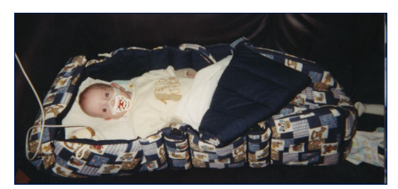
6 months old

without any aids, but he had a relapse. He didn't want to eat because we had probably pushed him too hard and his outlook on eating became very negative. He then practically starved himself by being 'scared' of food. We then decided, with the paediatrician, to have a gastrostomy placed (a tube is placed so that food arrives directly in the stomach). This turned out to be the ideal solution, as it was invisible and it didn't hurt. He fed through this tube until his fourth year of life. During this period, with his school, we taught him to eat normally. This was a huge struggle, but we did it. Now he is eating well and with pleasure and likes to taste new things. *** Age 4 years