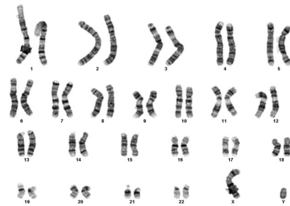
Chromosome pairs 1-22, X and Y (male)

There are 23 pairs of chromosomes and we inherit one half of each pair from each parent, making a total of 46 chromosomes. Of the 46 chromosomes, two are a pair of sex chromosomes: two Xs for a girl and an X and a Y for a boy.