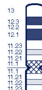
Approximate site of proximal deletions

There are reports of just three babies and children with a deletion between the jagged I (Alagille syndrome) gene and the