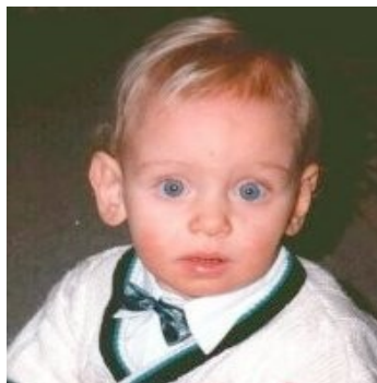
Diagnosed at 1 year

This Unique guide has been written to help signpost families whose children have just been diagnosed with either global developmental delay and/or a rare chromosome disorder. The guide is aimed at parents whose children are 4 years and under (pre-school age). It could equally be of use to parents whose children have no recognised diagnosis other than that of developmental delay. This guide is provided as a basic information guide to services available to families with a young child with additional needs whether they be mildly, moderately or severely affected either mentally, physically or both.